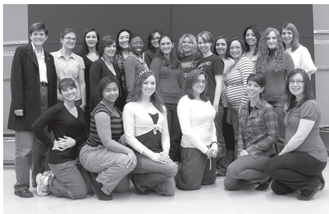
Metropolitan State College of Denver's Women's Chamber Choir