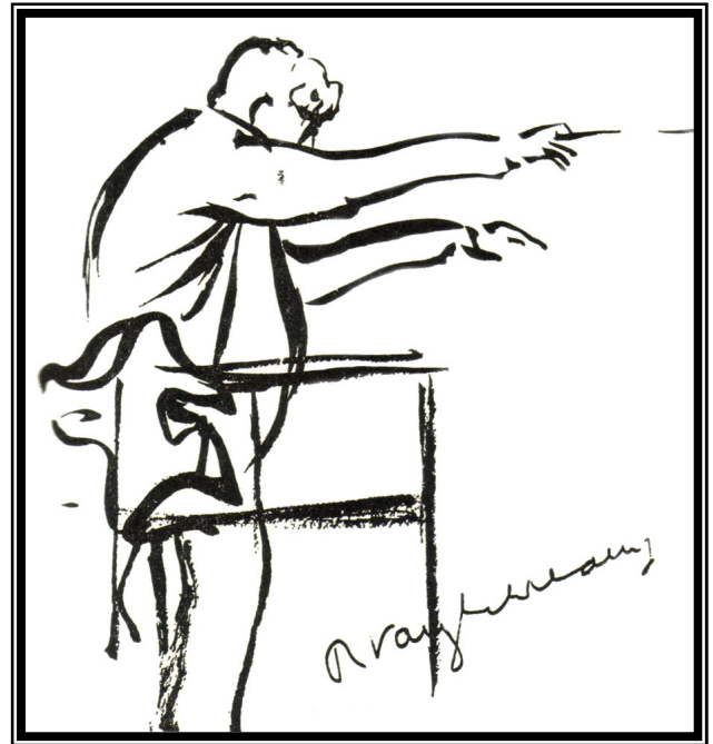
Ralph Vaughan Williams, c. 1951

"Masterworks for Double Choir" pays homage to this tradition with samples from most of these eras and genres, including Giovanni Gabrielli's great antiphonal works from St. Mark's, Venice; a curious anthem co-authored by the Spaniard Phillippe de Monte and the Englishman William Byrd; motets by Mendelssohn and Harris; and an excerpt