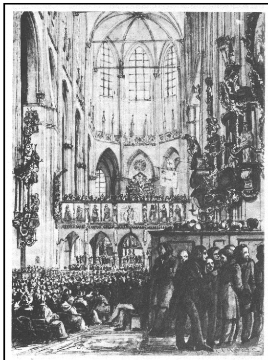
Interior of the Marienkirche, Lübeck, 1839

While every organist has heard of Buxtehude, practically nobody else has. His compositional output was almost entirely limited to organ music and Lutheran sacred choral music (mostly cantatas). But there is one Latin Missa Brevis that was written in an a cappella Palestrinian style that